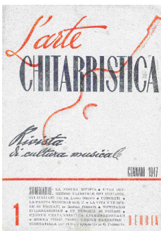
L'arte chitarristica (Modena 1947-1961)

Italy in the first half of the 20 th century